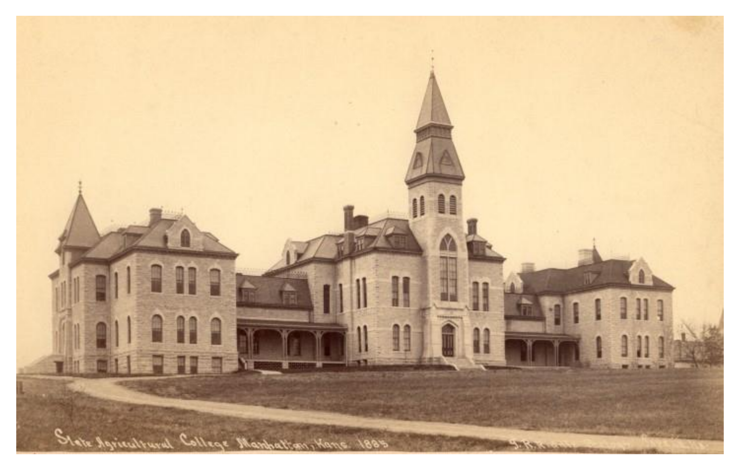
Anderson Hall-the administration building, 1885

Background : Kansas State University, as it is known today, began in 1858 as Bluemont College (Willard, 1940). Bluemont College was established as the first land-grant college by the provisions of the Morrill Act. As a result, it was renamed, Kansas State Agricultural College in 1863.